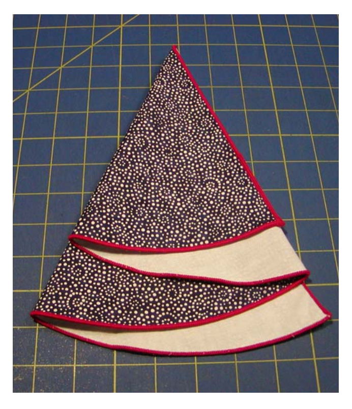
July - Rolled Hem Napkins

Technique - Rolled Hem and turning corners