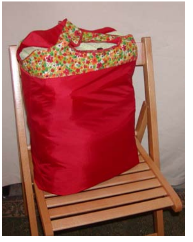
May - Handy Bag

Technique – Easy box bottom, rolled hem and ladder stitch