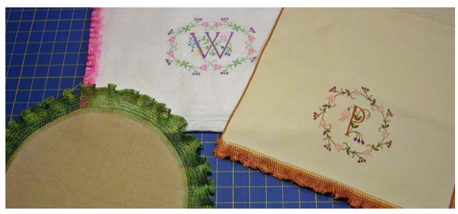
June – Serger Crochet

Technique – Easy box bottom, rolled hem and ladder stitch