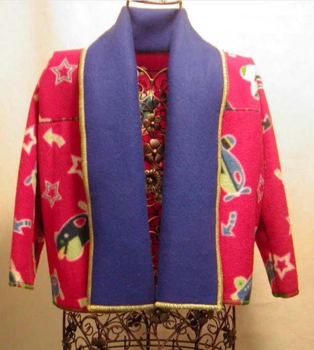
December - Bog Coat

Technique – Decorative edge finishes and flatlock seaming