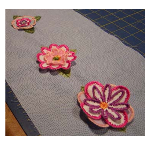
May - Stumpwork Technique – Free Standing Applique