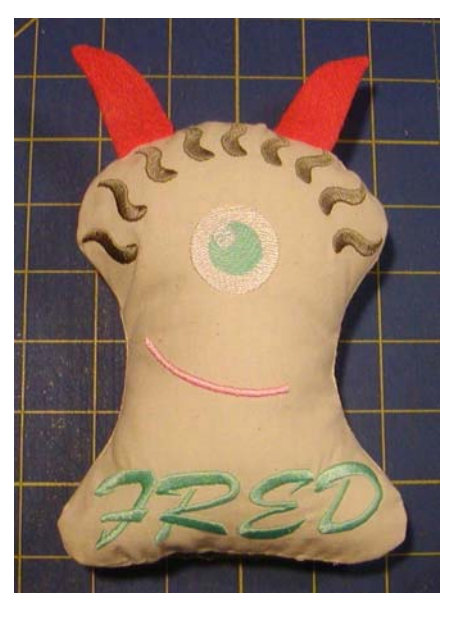
June - Stuffies Technique - combining designs and using text as design elements and motifs