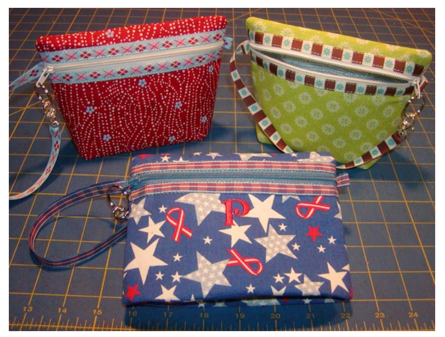
July - Wristlets Technique -Zippers in the hoop