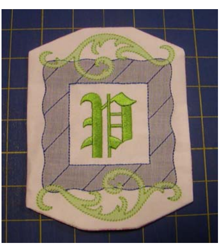
April - Shadow Work Technique - Shadow Work