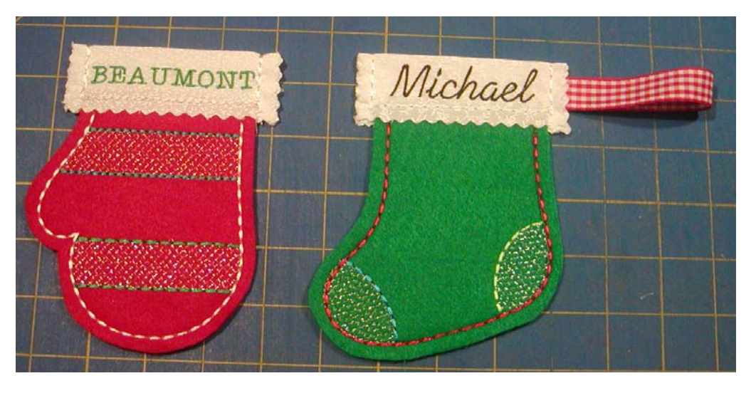
November – Gift Card Holder Technique – working with felt