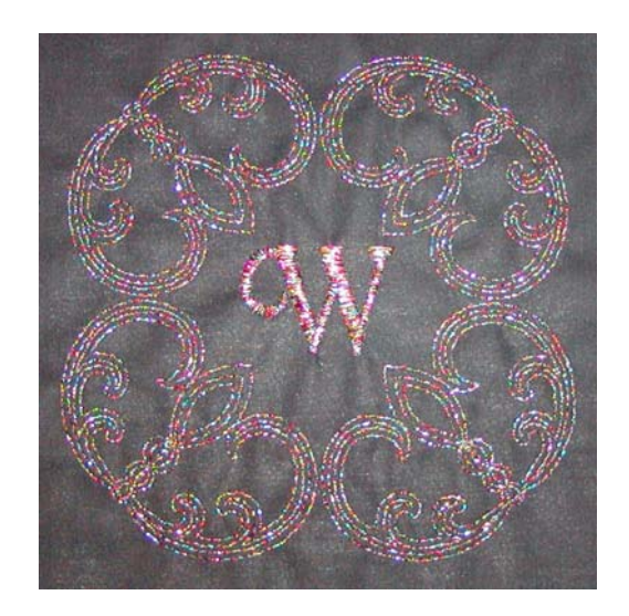
May – HolloShimmer thread Technique – HolloShimmer thread