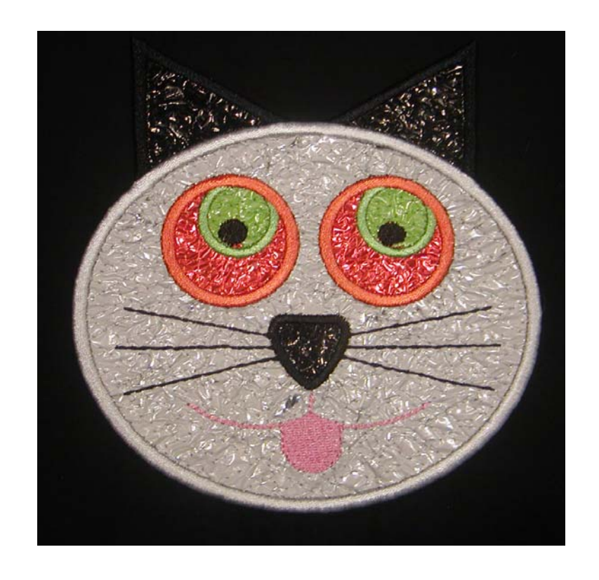
September – Mylar Technique – Mylar