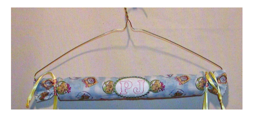
October - Tube covers Technique - Appliqué and ladder stitch