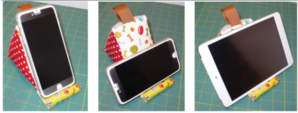
Small - with iPhone 6plus and iPad Mini