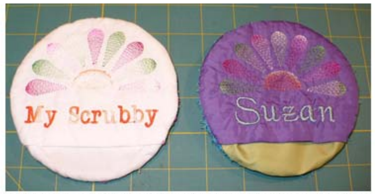
Sample on the left is bleached muslin for the lining and finger pocket Sample on the right uses Rip Stop Nylon – the green is the lining and the purple is the finger pocket The Rip Stop Nylon will dry faster, but the cotton feels better!