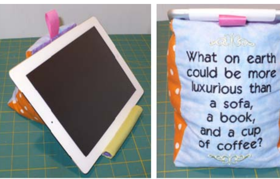
Medium size with iPad 2nd generation