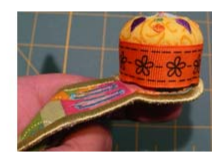
June – Pin Cushion Bling

Technique -Using lightweight cut away stabilizer