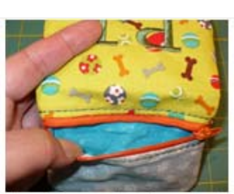
back zippered coin pocket