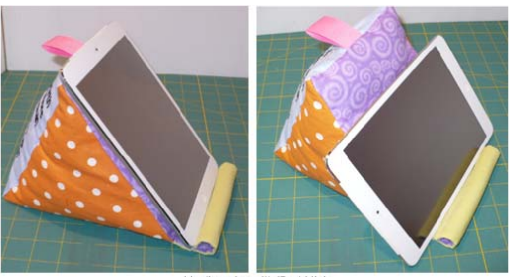
Medium size with iPad Mini