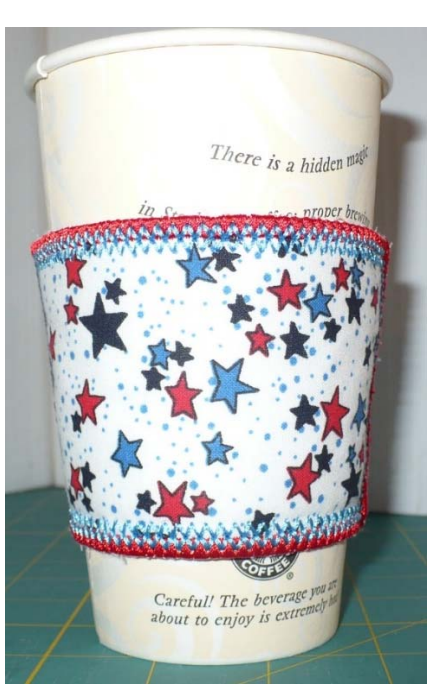
July – Coffee Sleeve

Technique -Multi part applique, In the Hoop