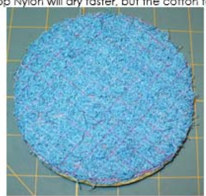
This is the scrubby part