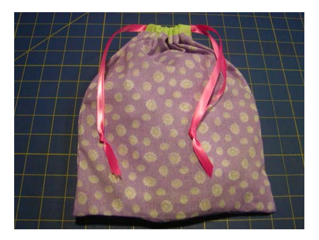
July - Packable Hat Technique - working with bias and casings