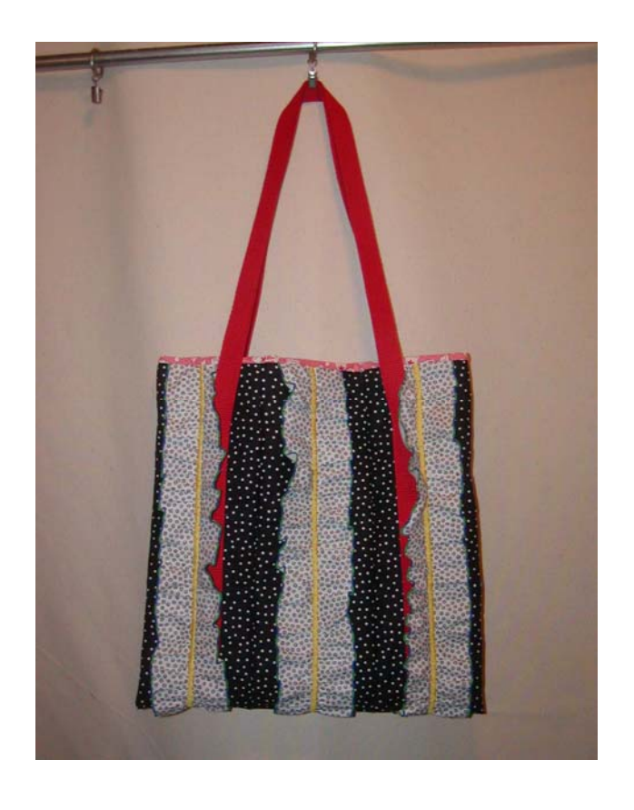
March - Ruffle Bag Technique - ruffles