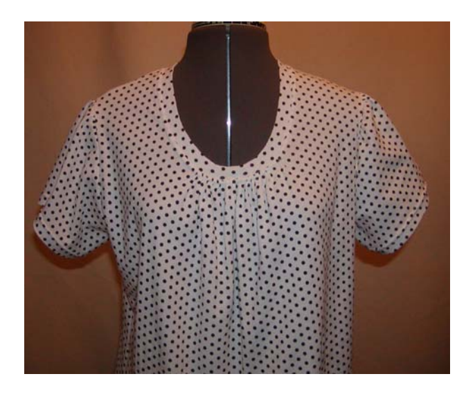
May & June – T-Shirts Technique – working with knits and ribbing