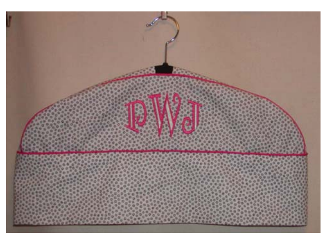
April - Hangar Cover Technique - zippers and piping