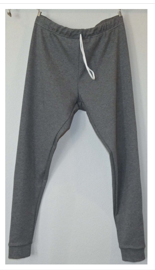
March – Elastic Waist Pants

Technique/s – Working with Drawcord elastic, how to do side seam pockets without a sideseam