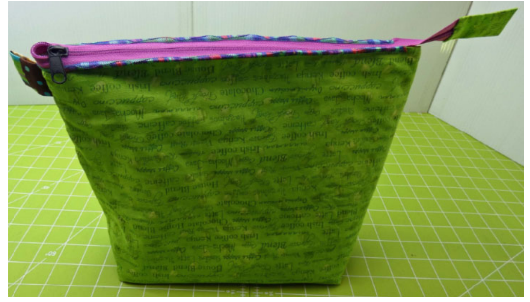
June – Reversible zippy