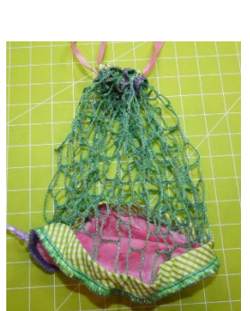
February – Veggie Bag