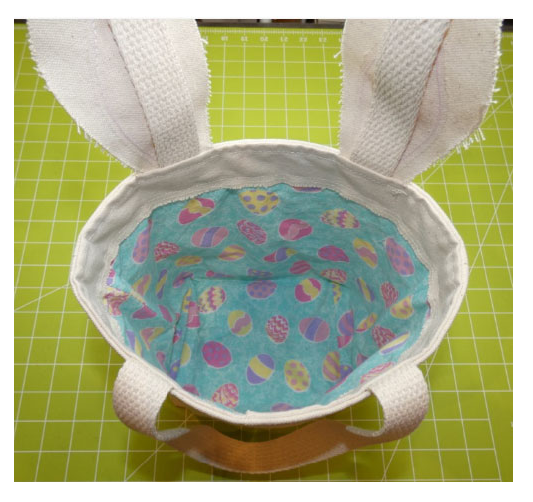
March – Bunny Bag

Techniques -Direct embroidery, applique and how to make a cute bag