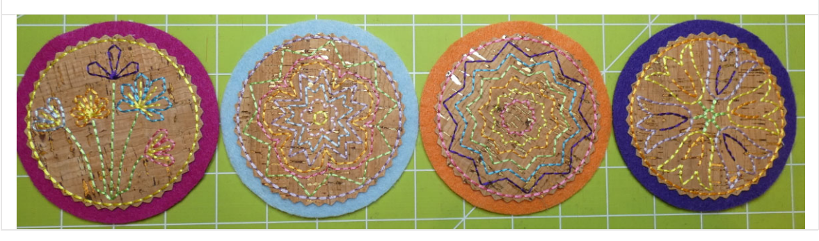
May – Cork Coasters