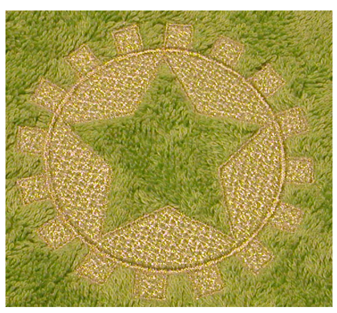
April – Towel Embosssing

Techniques -Direct embroidery, applique and how to make a cute bag