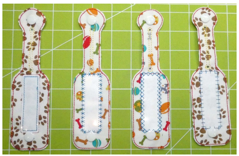
Go from this