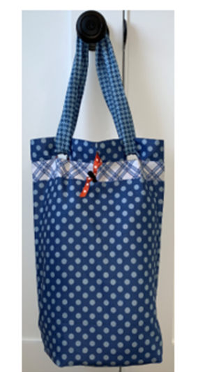
This is filled with 2 bath towels Similar volume to a plastic grocery bag