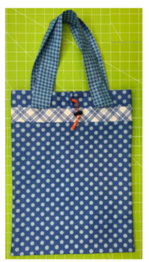
13" wide, 17" tall 6" box bottom

Technique/s – Stitch and Flip Quilting, Piping Corners and Piping Join