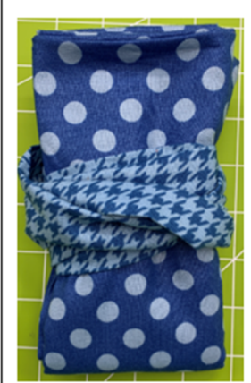
7" x 4" when folded